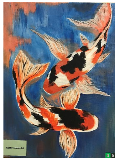
Tots to Teens 2017 – Highly Commended Two Koi Fish by Madeline Vu (15yrs)